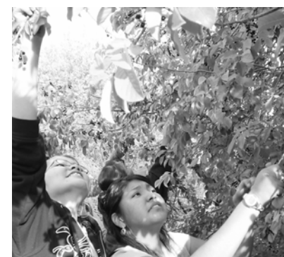
Students picking chokecherries during a field trip in the early fall.

The National Science Foundation is an independent federal agency that was created by Congress in 1950 to promote the progress of science.