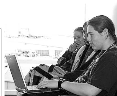
FWHS students were entertaining themselves while waiting in the Denver airport, en route to the National JOM conference in Tulsa, OK.